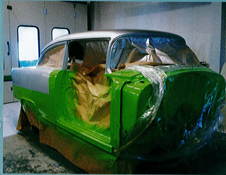
Scott copped (get it?) a bit of flak over his colour choice, but the result speaks for itself.